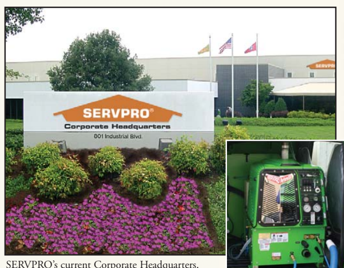
SERVPRO's current Corporate Headquarters.

Following tremendous growth in the late 1990's, Entrepreneur Magazine ranked SERVPRO® the #1 Franchisor in the restoration industry in 2004, 2005, 2006 and 2007. In fact, SERVPRO® was ranked #25 among all franchise companies of any type in 2007. In April 2005, SERVPRO® moved to a new 140,000 square foot facility in Gallatin, TN. The state-ofthe-art building houses a newly designed training facility and National Call Center.