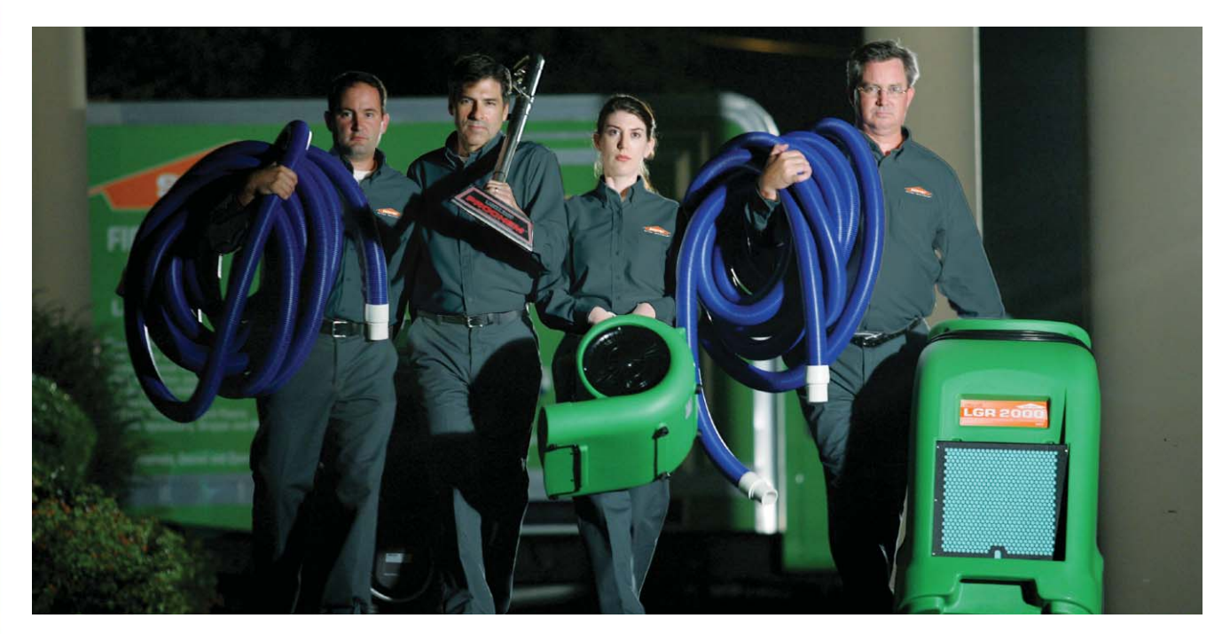
Over 1,500 Franchises Nationwide. Serving America Since 1967.