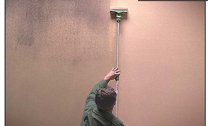
SERVPRO® Professional cleaning soot from walls.