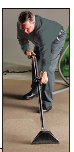
Right: SERVPRO® Professional cleaning carpets.

Mitigation requires quick action. The faster a SERVPRO<sup>®</sup> Franchise Professional arrives on-site to perform cleanup and restoration, the better the results – including lower claim costs.